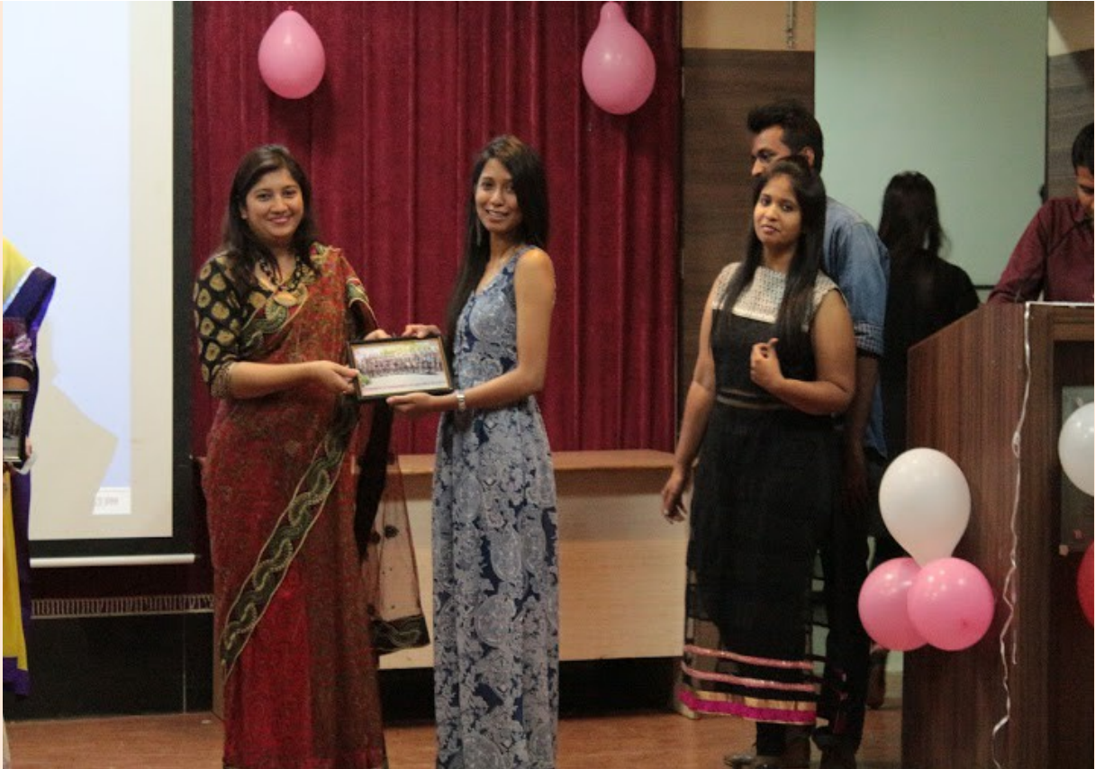
Students are receiving Token of Love from Fculties.