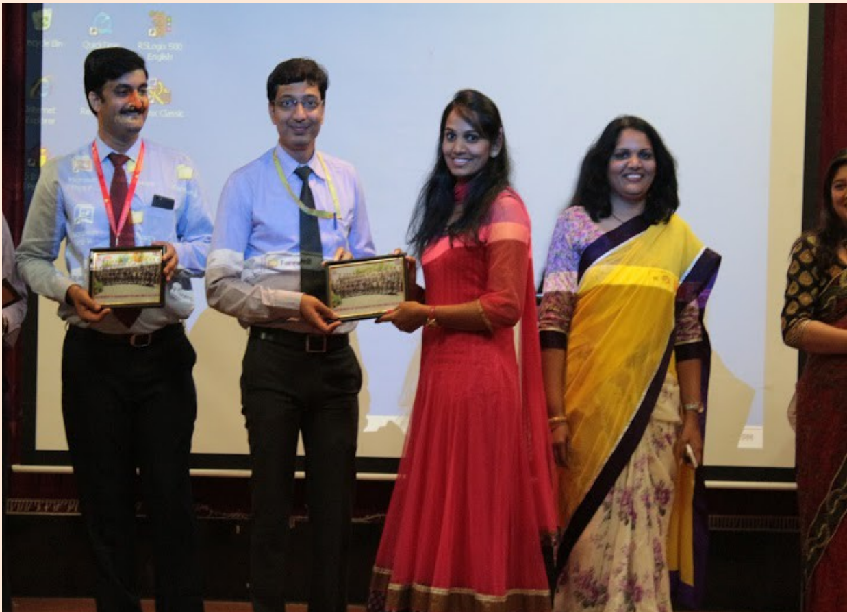
Students are receiving Token of Love from Fculties.