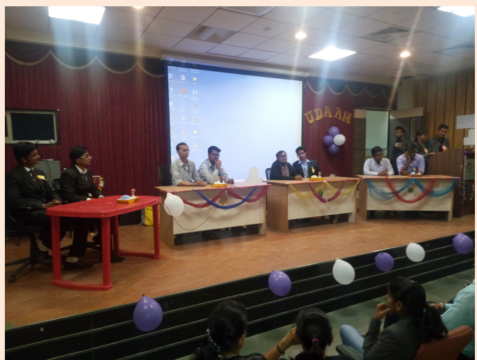
Student's Participation in Different events.